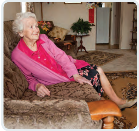
Figure 4. Pivot body around to sit on the chair.